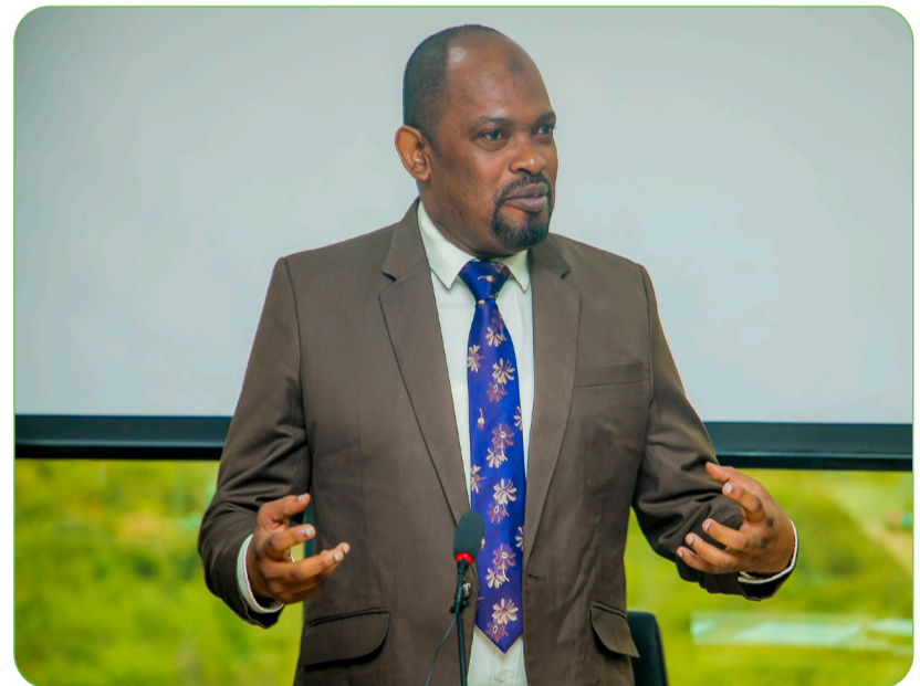
Deputy Minister for Finance and Planning, Hamad Chande, speaks during the opening of PPRA Workers Council meeting, recently in Dodoma